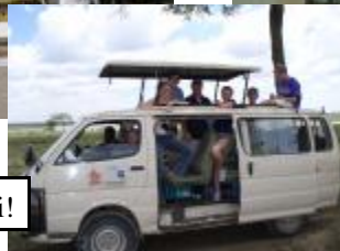
Our safari van in the Serengeti!

Why do people come to see me – a foreigner, Christian, missionary doctor when they get sick? Many think that the “white-doctor” knows more & is better than the local docs. Others like that I truly CARE about them. Others like it when I pray for them; for God’s healing. This week, a little MK girl fell out of a tree. X-rays showed a very badly dislocated elbow. I prayed for her. God used my hands to guide her elbow bones back into perfect position. No surgery needed; just a cast! God is GOOD!