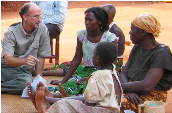
Village Medical Outreach Clinics