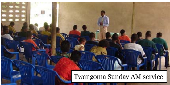
Twangoma Sunday AM service