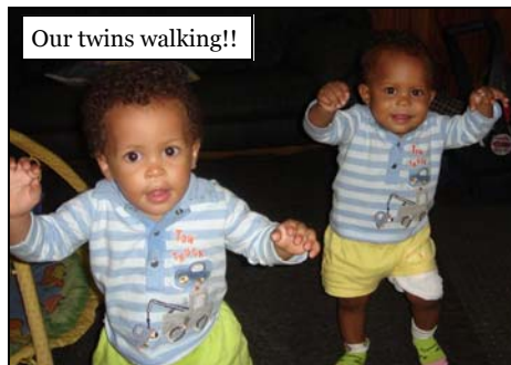
Our twins walking!!

Psalm 119: Is God's word central to my life? I need to read/ study /meditate-on/& memorize God's word regularly. I want to be pure. I want & need God's light/guidance to my path — Godly discernment for my daily decisions. Jesus is God's Word, incarnate. He spoke God's words to us. Do I believe it? Do I live it? Do I obey God's word & build on it as my life's foundation (building on the "rock", not on sand)? May God's will (not mine) be done. May all I do, be for His glory!