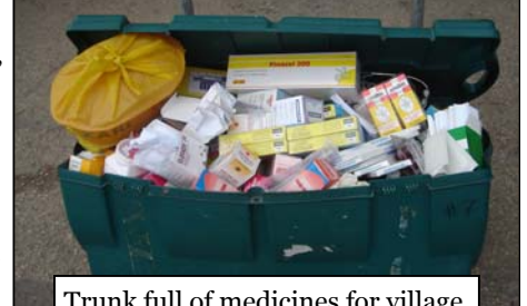
Trunk full of medicines for village outreach clinic to Jaja (by plane)